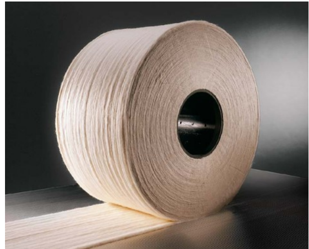
Homogeneous lap build-up and better fiber orientation

The OMEGAlap belt is suitable for combing preparation machines E 35 and E 36. It can be easily ordered through Rieter's webshop ESSENTIALorder with the part number 11304539. It works best in combination with original Rieter lap spools 11101049.