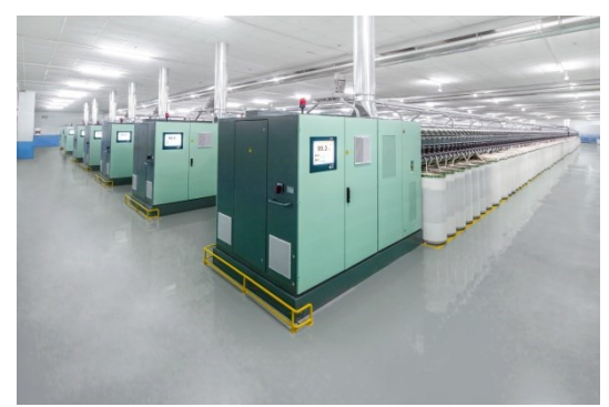
R 36 Rotor Spinning Machine https://rieter.picturepark.com/Website/?AssetId=69537