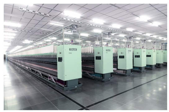
K 42 compact spinning machine