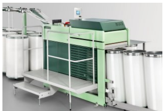
RSB-D 50 Draw Frame https://rieter.picturepark.com/Website/?AssetId=79477