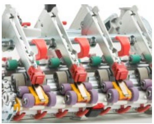
EliTe®CompactSet Advanced https://rieter.picturepark.com/Website/?AssetId=82293