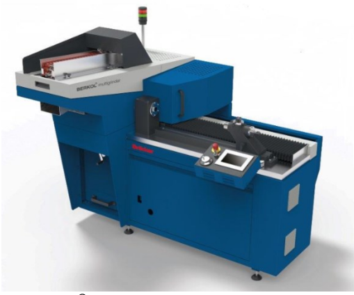
BERKOL<sup>®</sup> multigrinder MGL grinding machine https://rieter.picturepark.com/Website/?AssetId=82357