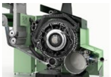
C 81 – outstanding carding quality thanks to intelligent sensors ID: 99135