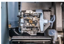
Autoconer X6 – unrivalled splicing quality, flexibility through automation ID: 99375