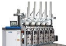
DP5-T – high quality air textured filament yarns ID: 96926