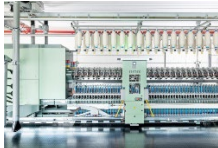
ROBOspin – enhancing profitability and optimizing labor management ID: 98087

Download link: https://rieter.picturepark.com/WorldPort/public/XSuAMMcg Expires June 30, 2024