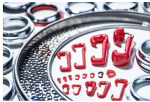
Key technology components from Accotex, Bräcker, Graf, Novibra, Suessen and Temco make the difference. ID: 97153