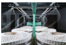
Newest draw frame generation – superior sliver quality and efficiency ID: 98342