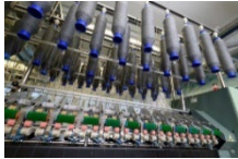
Recycling toolbox – increasing recycled ring yarn quality ID: 97957