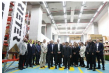
Türkiye – unlocking growth for a leading market ID: 100033

For further information, please contact: