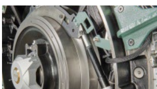
C 81 – outstanding carding quality thanks to intelligent sensors ID: 98490