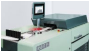
New draw frames – maximum efficiency with recycled material ID: 98306