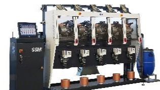
Sewing thread finish winder Thread King III by SSM – maximum efficiency ID: 98500