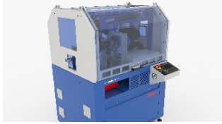
Supergrinder pro from Bräcker – on the path to breaking records ID: 98414