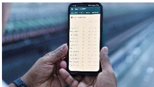
ESSENTIALoptimize – optimization across the entire system ID: 98559