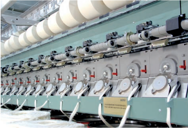
Most modern spinning technology for quality and productivity