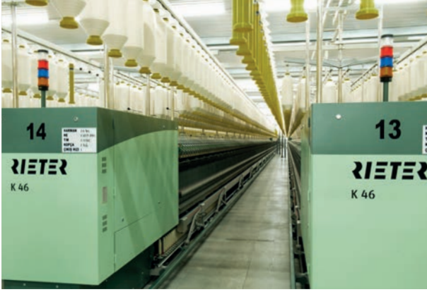
Compact Spinning Machines K 46