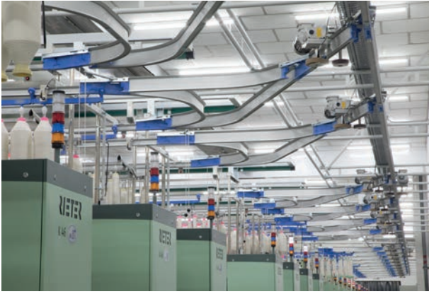
Compact spinning machine K 46 with SERVOtrail roving robbin transport system