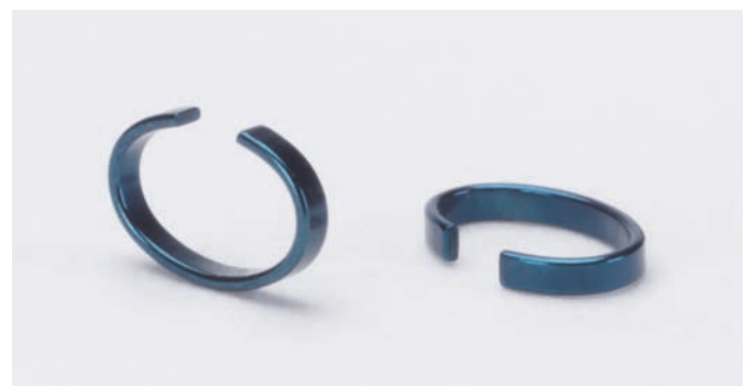
The original SAPHIR traveller with excellent gliding properties