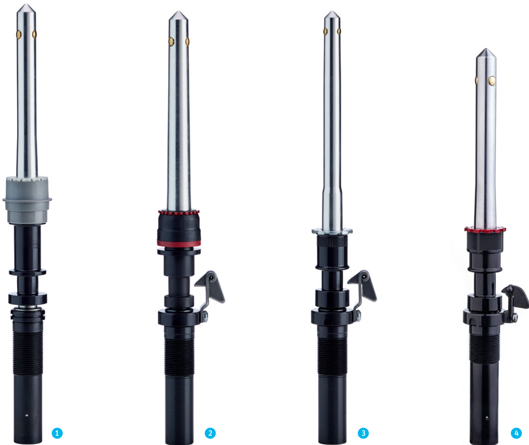
1. LENA with SERVOgrip 2. LENA with GROCOdoff 3. LENA with steel cutter 4. LENA with EASYdoff