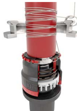
Empty tube fitted, Yarn clamped, Spindle start-up.