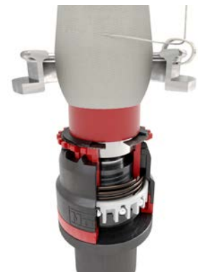
Spinning, Yarn released, Yarn end flies out of the system.