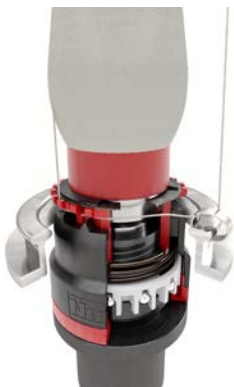
Cop is finished, Back-winding, Yarn inserted.