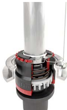
Spindle stopped, Yarn clamped, Cop is removed, Yarn cut.