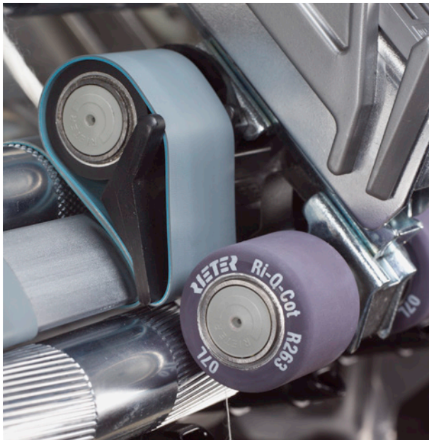
Q-package used on ring spinning machines

The drop-shaped pin optimizes the short fiber guidance. This allows raw material savings of up to 2% in the combing process, while maintaining original yarn quality. The benefits with the yarn characteristics are far more distinctive with a raw material that has a high short fiber ratio.